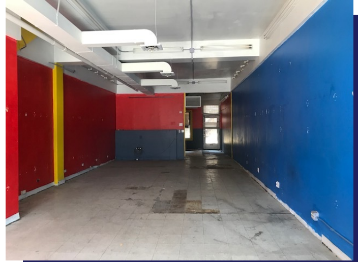
6234 N Broadway Street Vacant