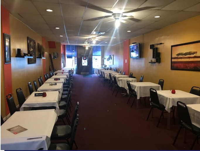
6232 N Broadway Street Vee Vee African Restaurant