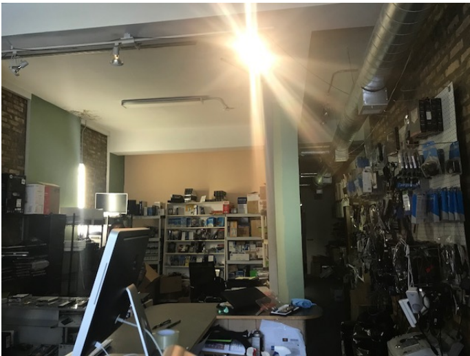
6236 N Broadway Street Broadway Computers